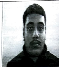
Test Day Photo

house no.416, street no.7 chander lok, mandoli road, near punjab national bank shahdara delhi-110032